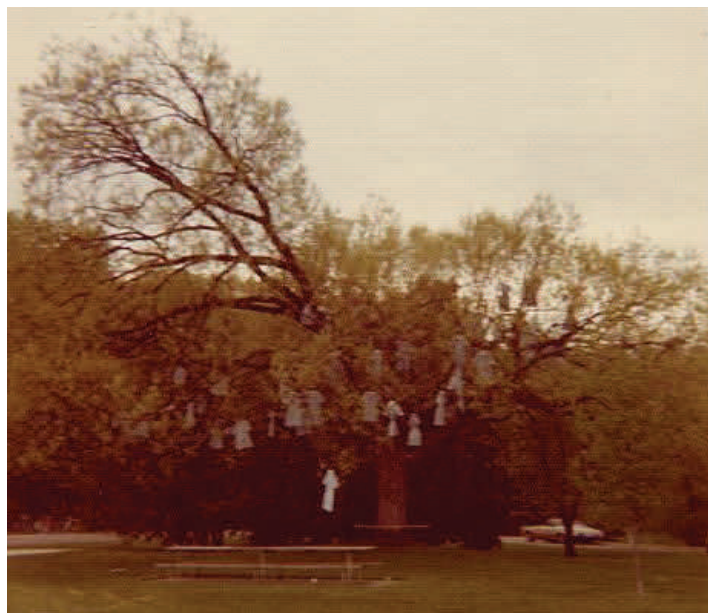
Nursing uniforms in the Council Oak Tree, 1976.