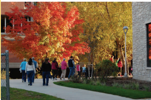
Walking between the McIntyre Library and the new Davies Center.

Mark your calendars for the next homecoming walk on Saturday October 12, 2013. See you there!!