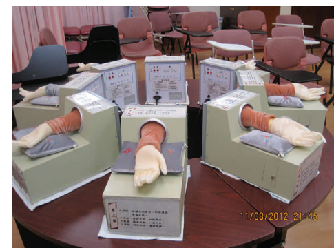
Photo: Pulse simulators used in teaching the identification and meaning of the different pulses in Traditional Chinese Medicine. Photo taken at the nursing laboratory at Polytechnic University, Hong Kong.

to promote connections between the universities and UW-Eau Claire. They also toured hospitals in addition to going on home visits. Two possibilities being explored are creating an opportunity for students at UW-Eau Claire to learn more about Traditional Chinese Medicine and for faculty from China to visit our College of Nursing and Health Sciences during the 2013-2014 academic year.