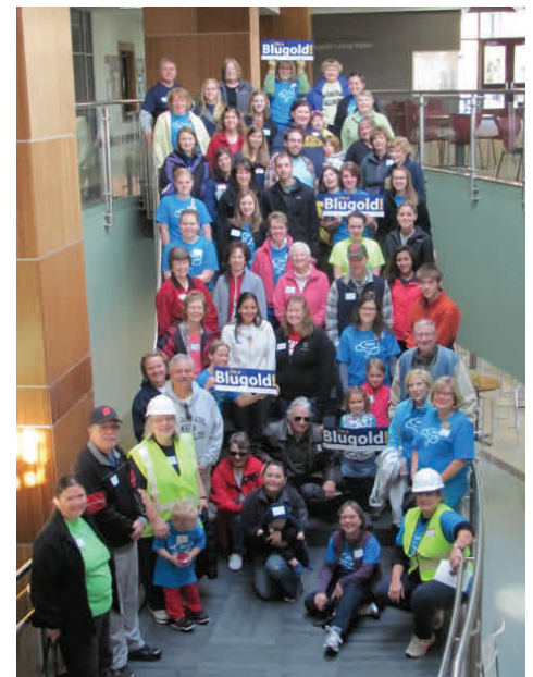
Walkers on the grand staircase of the new Davies Center.