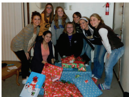
ECSNA members with presents donated to the Salvation Army's Adopt a Family program.