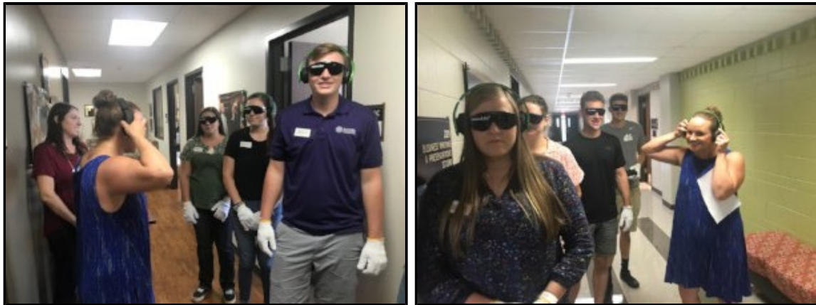
A big thanks to M3 Insurance for hosting the annual UWEC Madison Area Alumni Gathering!