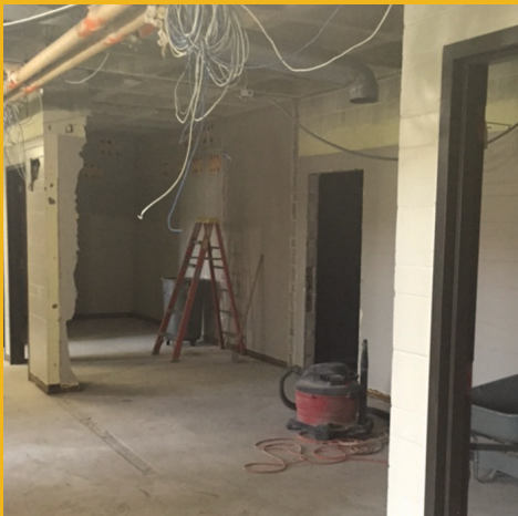
From bare floors ...

Last year, we set out to create a new dedicated physical space to house CHAASE and the HCAD program, and we are excited to report construction has finished, and we are moved in. The new space provides students and faculty an updated collaborative area, a conference room environment that integrates web-based computer and multi-media learning, dedicated offices, a student research workspace, and other strategic areas — allowing us to share in discovery and learning, and work together more effectively. This has been made possible by the generosity of many individuals and corporate sponsors supporting the vision of having a professional presence and work environment for our Center and program. We now have a place to call home. A special thank you to our campus facilities for their hard work in completing the project on schedule, and to Direct Supply for assistance in the planning process and support in the purchase of furniture.